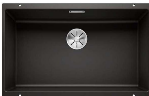
FREGADERO BLANCO 523442 V2 SUBLINE 700-U + VALVULAS EN NEGRO