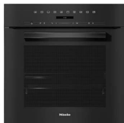
HORNO MIELE H 7264 B OBSDW