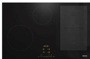
PLACA INDUC MIELE KM 7414 FX