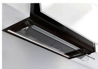
CAMPANA PANDO 10183 TIM-2/90 NEGRO V850