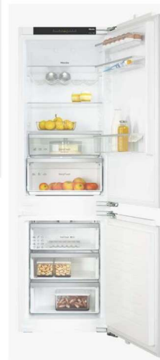
COMBI MIELE KDN7724E