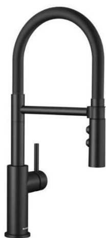
GRIFERIA BLANCO 525793 CATRIS-S