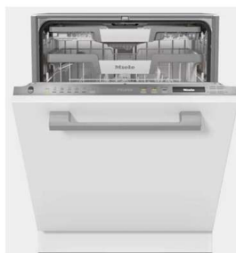
LAVAVAJILLAS MIELE G 7191 SCV