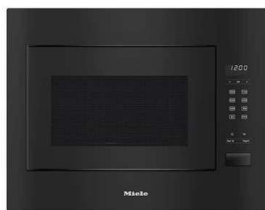
MICROONDAS MIELE M2240SCBSW